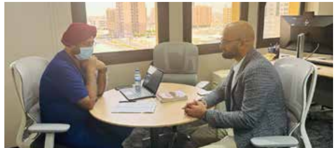
At RAKEZ – Al Hamra